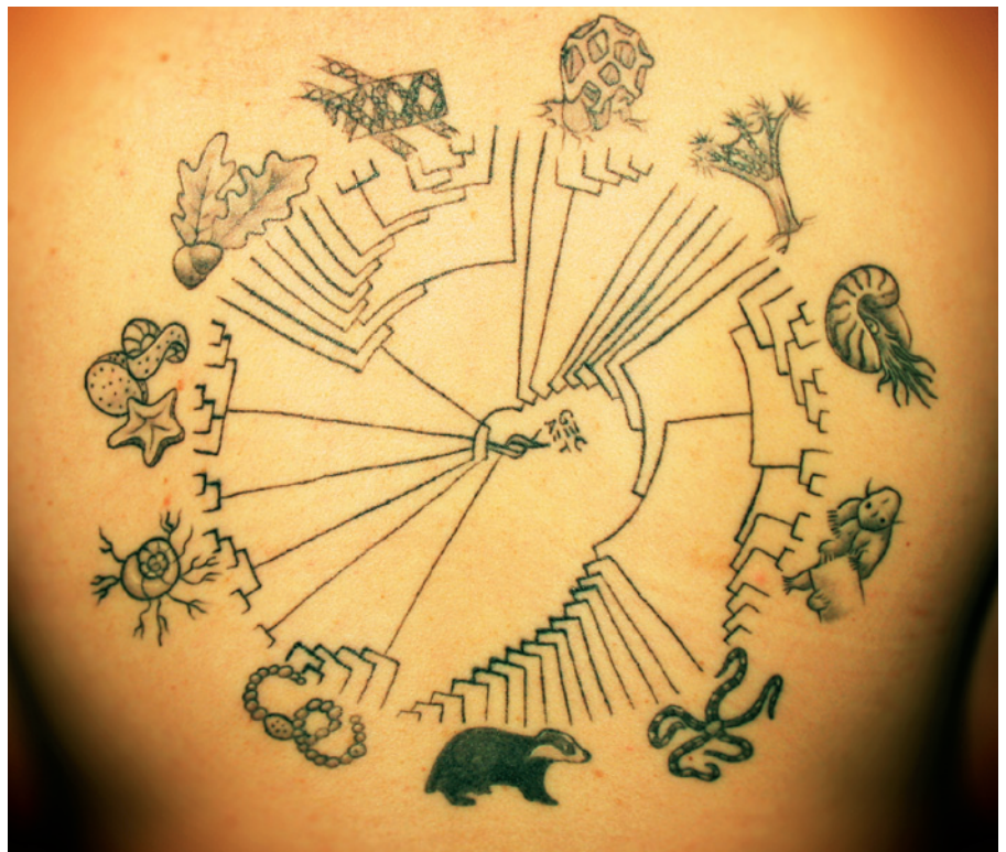
A biology graduate's back carries a reminder that DNA gave rise to all the biodiversity on Earth.